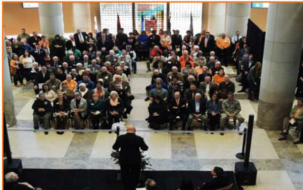
Attendees gathered at Hodges Library to welcome the new Veteran Resource Center.

Those in attendance were also welcomed by Country Music Recording Artist Charlie Daniels through a personalized video message.